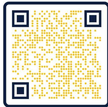
WHATSAPP WEDNESDAY SESSION 2