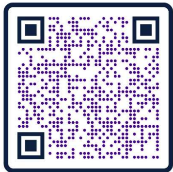
WHATSAPP WEDNESDAY SESSION 1